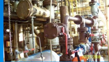
March 15, 2008 Platform Eureka Returned to Production