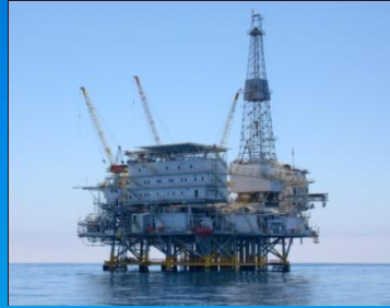
July 8, 1984 Platform Eureka Installed