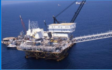
January 15, 1980 Platform Ellen Installed