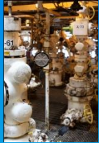
January 13, 1981 Ellen First Production